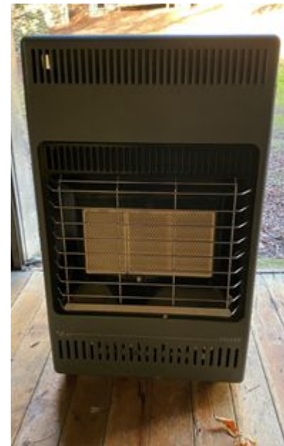
Church organ and heater from the Tarras Church.